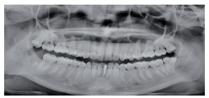
Figure 2. Panoramic radiograph showing the remaining tooth root.

The tooth root was removed under conscious intravenous sedation and local anesthesia at the 5th day of hospitalization when the patient's mouth opening was right for extraction. No complication was observed during the first postoperative week