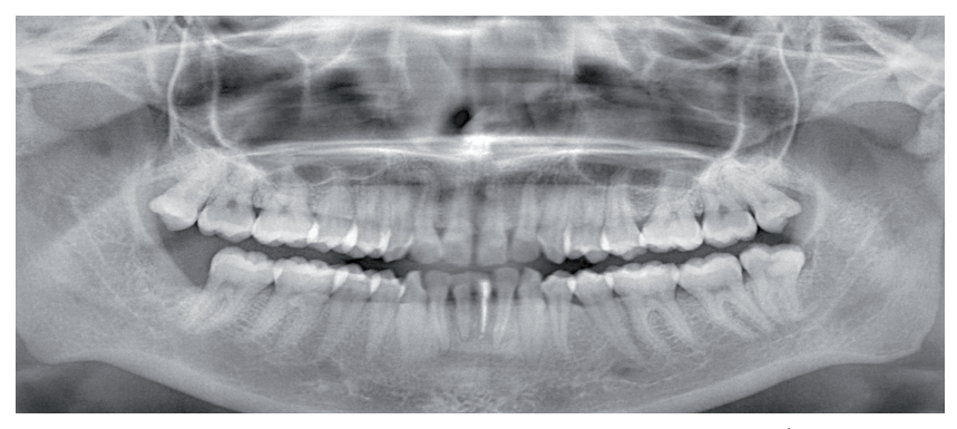
Figure 3. Panoramic radiograph showing good bone healing at postoperative 3rd month.

and the patient was discharged from the hospital asymptomatically one week after the surgery. A follow-up panoramic radiograph was taken at postoperative third month and healing was observed in the extraction site (Figure 3).