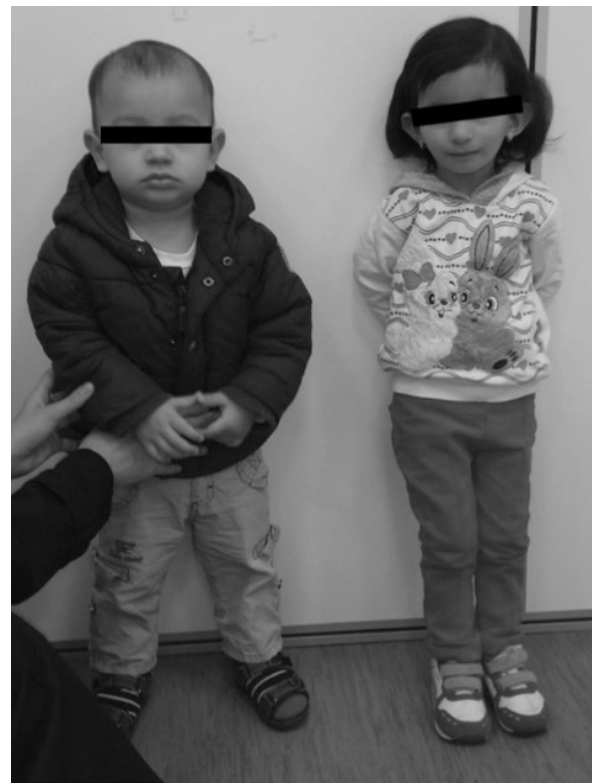
Figure 1. Picture showing the short stature of the 4-year-old child and her healthy 2-year-old brother.

A 4-year-old girl genetically diagnosed with RSS was referred to the Marmara University Department of Pediatric Dentistry in 2016 with the complaint of pain and reduced chewing ability. The clinical appearance has a typical phenotype of RSS with a characteristic small triangular face with a prominent forehead and micro-gnathia with retro-gnathic mandibula. Genetic testing was performed and hypo-methylation of the paternal 11p15 imprinting control region 1 (ICR1) on H 19 gene has been found as confirmatory of the clinical findings. The body mass index of the 4-year-old girl was found to be weak (10.46 kg/m 2 ) with low weight (8.1 kg) and with short stature (88 cm), as shown in Figure 1.