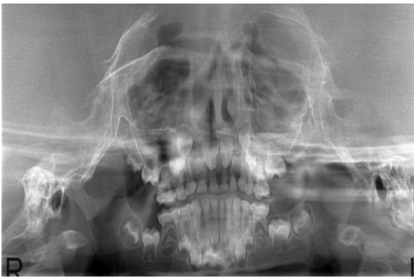
Figure 5. Panoramic X-Ray of the patient.

The parents were instructed on the dietary intake and also informed on misconceptions of feeding during the night. Oral hygiene manifestations were highlighted with brushing practice. Topical applications of fluoride varnish were suggested every 3 months and CCP-ACP gel (MI Paste, GC) for daily usage. Restorative treatments were performed for carious lesions in a minimally invasive manner.