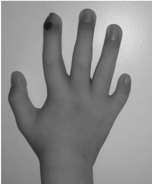
Figure 2. Fifth finger clinodactyly.

Asymmetry of the limbs, high-pitched voice, fifth finger clinodactyly (Figure 2) and blue sclera are the other clinical findings of the patient, however there were no physical features such as café au lait macules or genitourinary defects. Learning and motor-coordination difficulties have not been reported for this case, either.