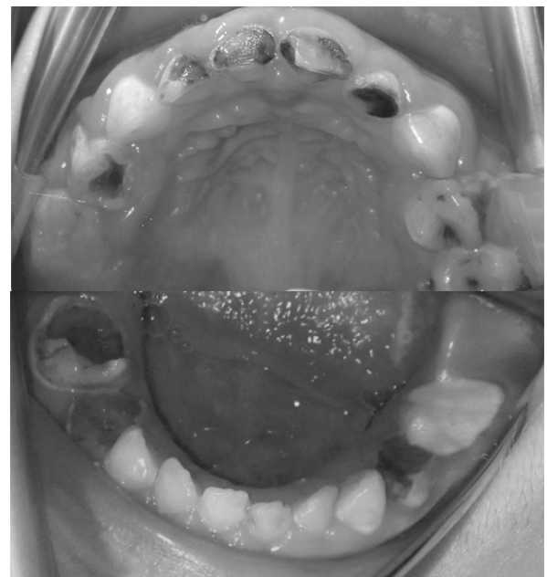
Figure 4. Intraoral pictures represent severe dental caries.

A mild crowded primary teeth progress in a normal time of dentition. The radiologic examination without cephalometric analysis was done for the permanent teeth to search for the dental anomalies which are not present for the case (Figure 5). Caries presence was evaluated by using the WHO criteria 11 and decayed-filled teeth and surface score (dft/dfs) were calculated 13/37, respectively. Thus, the child is at a high caries risk level for her age and with systemic requirements.