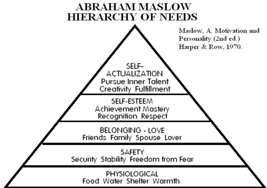
Figure 2 Abraham Maslow's Hierarchy of Needs

Maslow is interested in humanistic psychology in his studies. He is the creator of the 'Hierarchy of Needs'. As it is shown on the pyramid, self-actualisation is the top level of the human beings according to him. Maslow argues that Self-actualisation can be defined as helping others and having a connection to something superior to us, like God. (The Psychology Book, p.139)