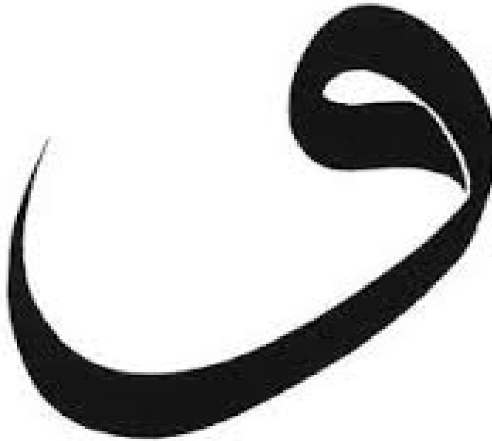
Figure 1 The Letter Waw