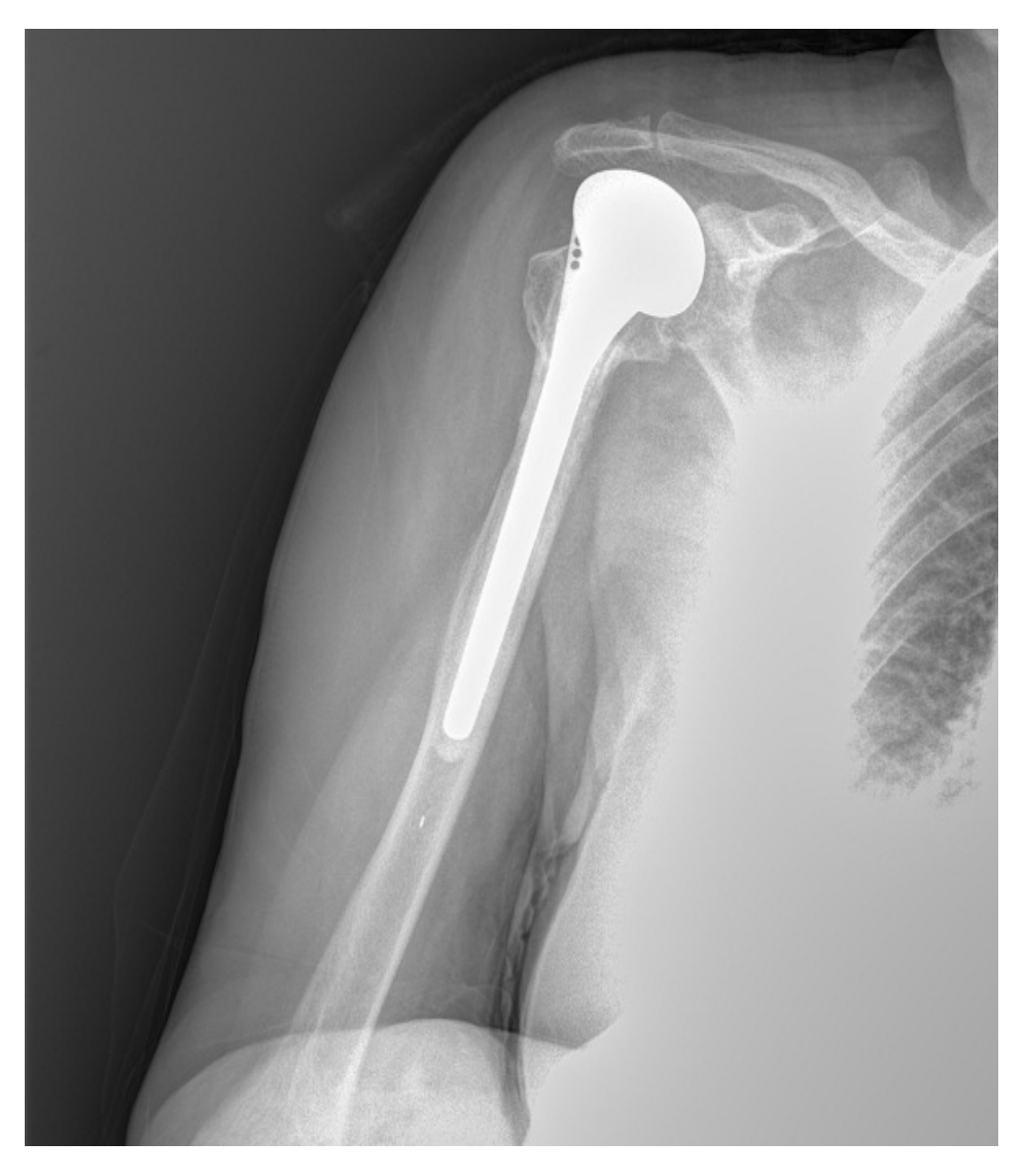
Figure 4: It is seen that tuberculums were united at two years after the operation.