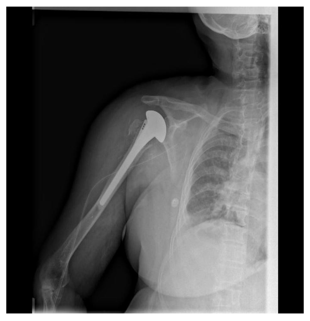
Figure 3: Early postoperative AP x-ray view of 71-year-old women with right 4-part acute fracture of the proximal humerus.

Müjdat ADAŞ, İsmail KALKAR, Cem Zeki ESENYEL, Semih DEDEOĞLU Yusuf ÖZCAN, Kürşat BAYRAKTAR, Murat ÇAKAR, Ayşın ERSOY