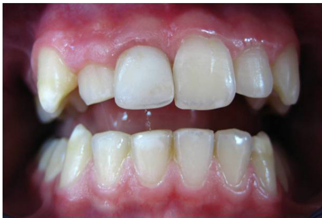
Figure 7 Frontal view of the fractured tooth after treatment.

Surgical extrusion is a one-step procedure that is simpler and less time-consuming, requiring minimal commitment from the patient. 1,3,8 The main drawback to this procedure is the possible risk of root resorption because of damage of the periodontal ligament. 1,3 Considering the disadvantages of the other methods mentioned above, we chose orthodontic extrusion to expose the fracture line before restoration in the case reported here.