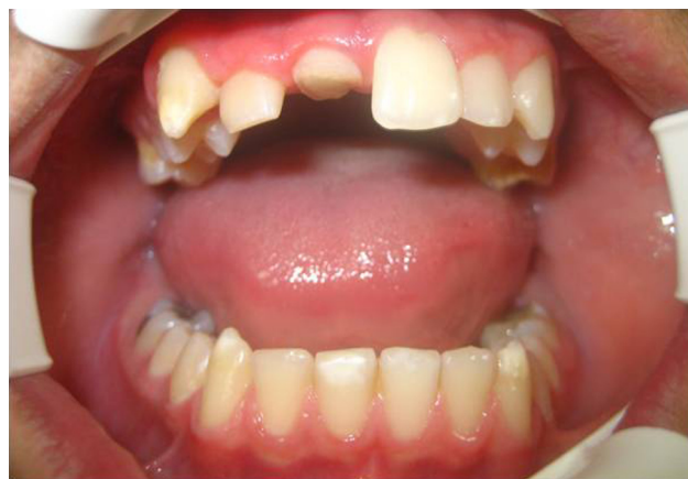
Figure 4 Fracture level rising 2 mm over the gingival margin with 8 weeks of orthodontic treatment.