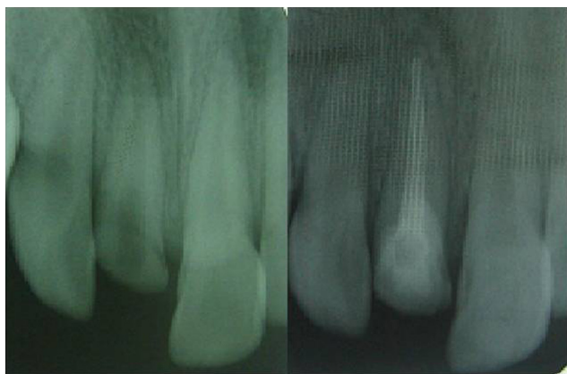
Figure 2 Radiographic view of fractured tooth before and after endodontic treatment.

Königsbach-Stein, Germany) cemented within the root canal using dual adhesive cement (Panavia F2.0; Kuraray Medical Inc., Tokyo, Japan). The post was covered with flowable composite (Aelite Flo; Bisco, Inc., Schaumburg, IL, USA; Fig. 5). Tooth preparation was performed with a circumferential shoulder margin configuration and a ferrule was set up to increase the fracture resistance of the remaining tooth structure and the retention of the prosthesis (Fig. 6).