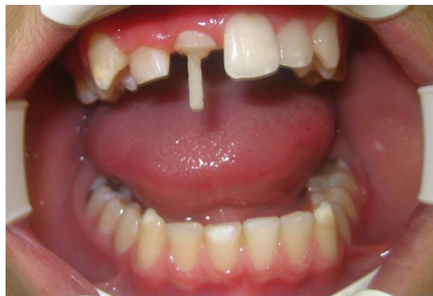
Figure 5 Fiber post at adequate dimension was placed into the fractured tooth.

A number of treatment options have been proposed for crown-root fractures, each with their own advantages and disadvantages. 1-6,8-10 Extraction should not be the first choice of treatment for a fractured or extremely broken young permanent tooth in the anterior area, 7 because it leads to loss of bone in the area, compromising future treatment with implants. 1,3 In this case, if extraction were performed, an uncomfortable removable appliance would have to be worn until the patient is 18-years-old. The associated potential for plaque retention increased the