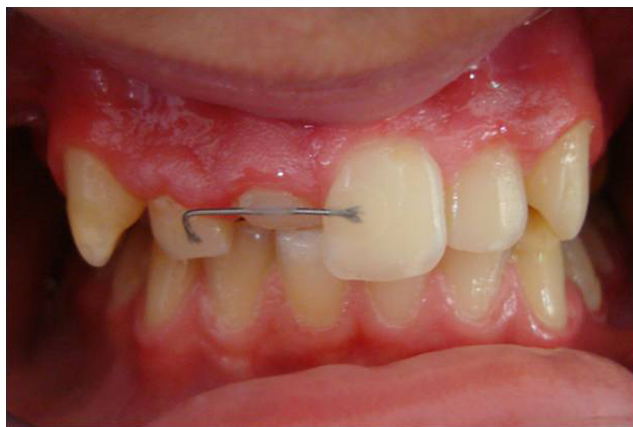
Figure 3 Extruded tooth was retained with arc wire for 4 weeks to prevent any relapse.

After 18 months, clinical and radiographic examination showed good esthetic results and periodontal health. No relapse occurred during the follow-up period, and the tooth showed no signs of root resorption.