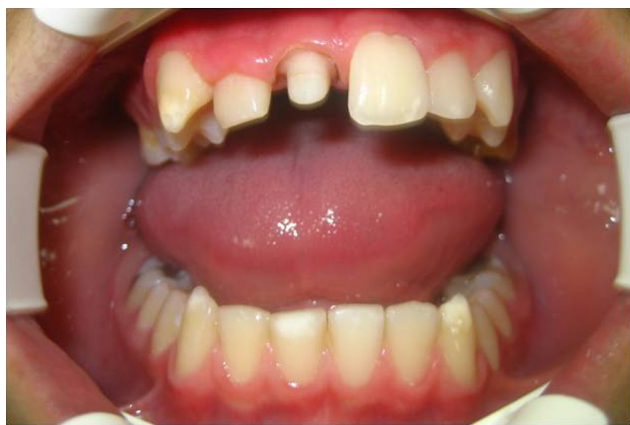
Figure 6 Resin core built and tooth prepared with a circumferential shoulder margin configuration.

caries risk of adjacent teeth. 5 To avoid these problems, we had to consider alternative treatment modalities.