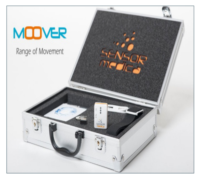
Figure 1. 3D Motion Sensor m00ver®.

deviation. After positioning the wrist at the target angle prior to the measurement with the device's own software, which gives visual feedback, individuals were asked to keep this position in mind and then to put the wrist into the same position. The angles of participant's wrist position axes were noted and the absolute value of the difference between the target angle and position angle was recorded as the amount of "Joint Position Sense Error". Measurements were repeated three times for each movement and the arithmetic mean of three error values was recorded as the amount of wrist JPS error <sup>13-15</sup>.