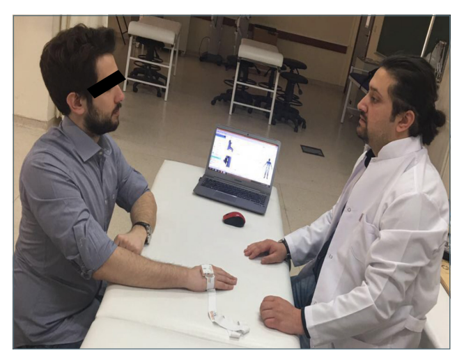
Figure 2. Wrist radial and ulnar deviation joint position sense.

Baseline Pneumatic Bulb Dynamometer<sup>®</sup> (BPBD) device was used to assess the grip sensitivity. The maximum grip strength was measured with the BPBD