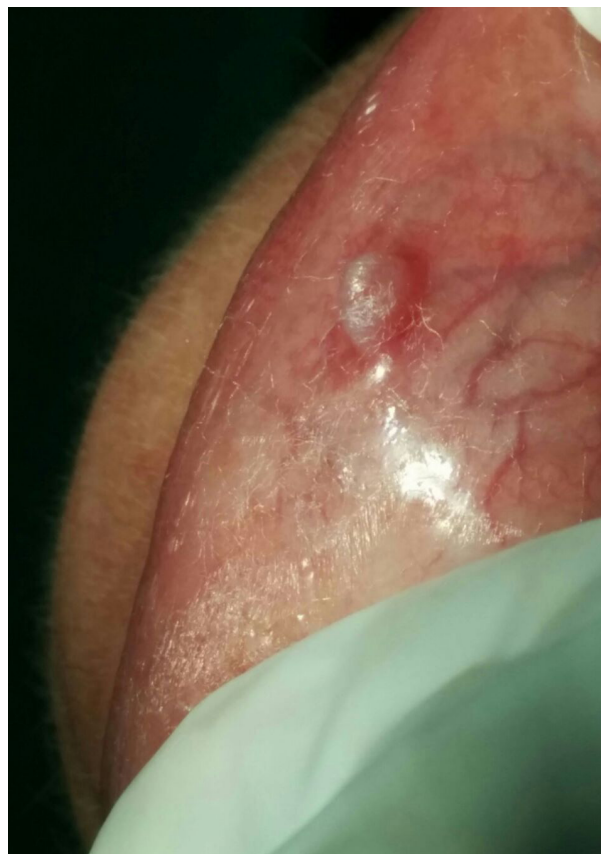
Fig [1] Pre-operative picture