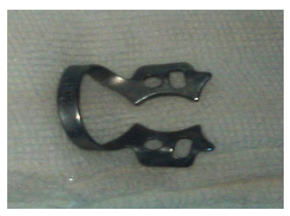
Figure 2. Ingested rubber dam clamp

On the third day, he was allowed to feed orally and he didn't experience any problems. He was discharged on the fourth day. On the one week follow-up the patient told that, he didn't feel any discomfort and he could feed himself without any problem. The otolaryngologists agreed that he was completely healed and no more follow ups were necessary. The lower right second molar was extracted due to a vertical fracture.