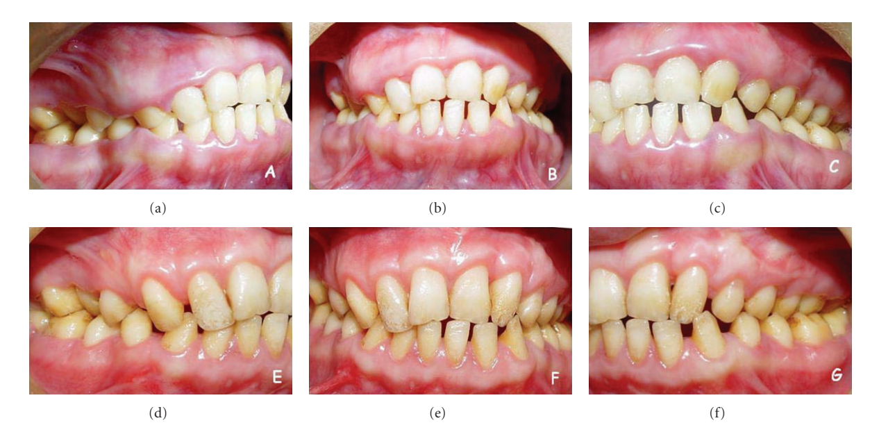
FIGURE 2: Initial appearance of 19-year-old patient presents more mild gingival enlargements comparing with her younger sibling ((a), (b), and (c)). Appropriate gingival form is constituted by periodontal flap surgery at the 3rd month before prosthetic treatment ((d), (e), and (f)).

Selcuk University. Medical conditions of the patients were normal and there were no signs of any syndrome. Intraoral examination of both patients revealed yellowish-brown, rough, and atypical enamel formation. Generalized fibrotic gingival enlargements with secondary inflammation covering almost all teeth were also seen. Clinical crown lengths were short because of AI and diffuse gingival enlargement in both patients (Figures 1(a), 1(b), and 1(c)) and Figures 2(a), 2(b), and 2(c). However, these findings were more severe in the younger sister. O'Leary plaque index [32] was found