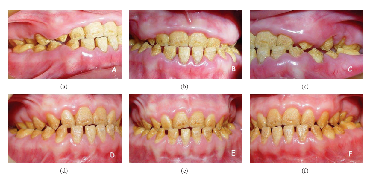
FIGURE 1: Initial aspect of the 12-year-old patient displays diffuse gingival enlargements covering almost all teeth ((a), (b), and (c)). Appropriate gingival form is established by periodontal flap surgery and maintained for 3 years ((d), (e), and (f)).