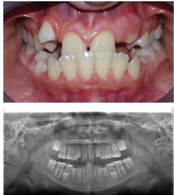
Figure 1: Initial intraoral photograph and panoramic radiograph

an Angle Class I molar relationship for both sides, -2mm overjet and 4mm overbite, 2mm midline discrepancy of maxillary dental arch to right (Figure 1). The hand wrist radiograph showed that the patient was at peak skeletal stage (MP3cap) and panoramic radiograph showed that she has bilateral congenital absence of maxillary lateral incisors.