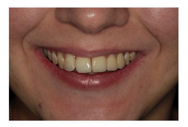
Figure 8: Case-2, after 1 year.