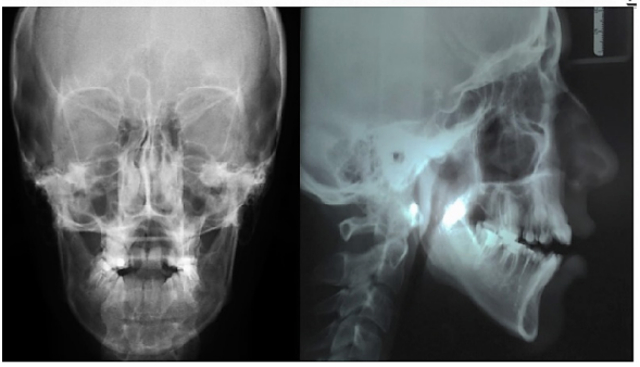
Figure 3. Orthopantomography and Cephalometric images

Magnetic resonance imaging (MRI) was utilized for better evaluation of the temporomandibular joint (TMJ). Anterior displacement without reduction in the right TMJ disc and subluxation of the right condyle and osteophytosis was observed. When the mouth tried to move to the open position, the condyle could only move a little forward. Anterior displacement of the left TMJ disc without complete reduction, subluxation of the condyle, and slight osteophytosis were observed When the mouth tried to get into the open position, the condyle could only move to the lower posterior part of the temporal eminence (Fig. 4).