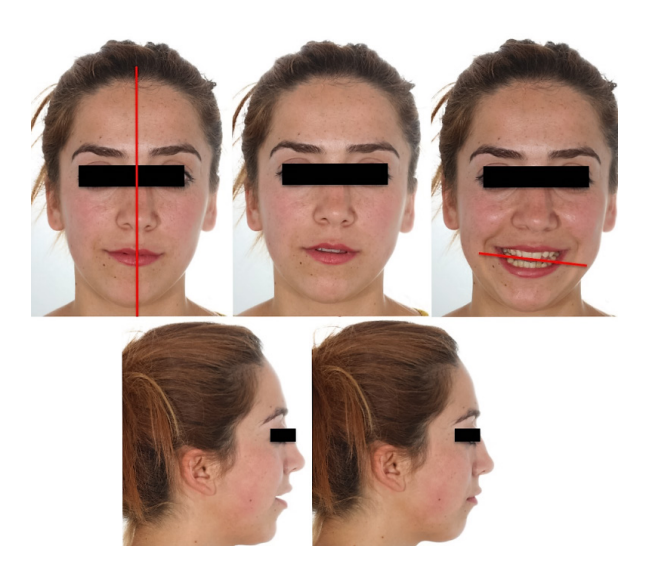
Figure 2. Extraoral images

examination, asymmetrical facial presentation was observed. The inferior tip of the jaw was deviated to the right. Occlusal cant was seen in the maxilla. The patient had a convex profile. The patient could not close her lips when the teeth were in occlusion, in the free position without muscular hyperactivity (Fig. 2).