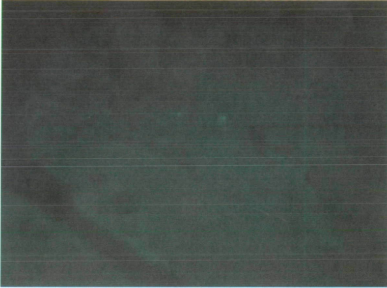
Fig 2. Dextran in Lamina propria

the negative group was not transported into the lamina propria.