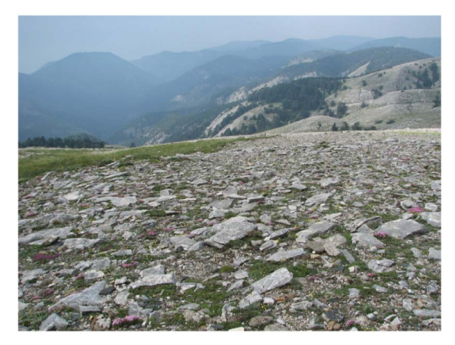
Fig. 3. An appearance from the summit area of Kazdağı National Park

Edremit province, the dry period lasts for nearly 5.5 months, from the beginning of May to the beginning of October.