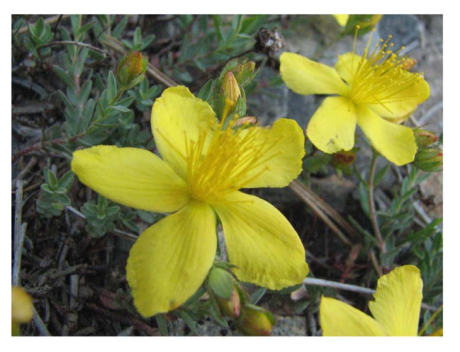
Fig. 4. An endemic species of Kazdağı National Park, Hypericum kazdaghensis Gemici & Leblebici

Also the botanical nomenclature follows the "Flora of Turkey and East Aegean Islands" of Davis (Davis, 1965-1985).