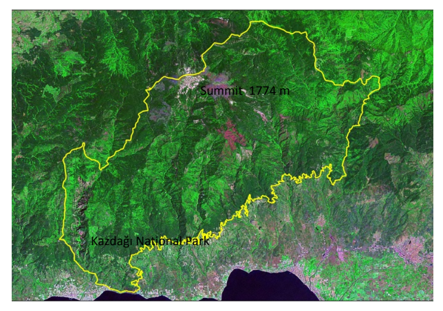
Fig. 1. Map shoving the study area, and its location in northern west part of Turkey.

The area lies between the Mediterranean and submediterranean climatic regions. The climatic characteristics are warm to hot dry summers and mild cool wet winters. The Mediterranean climatic region can be divided into three distinct sub regions: