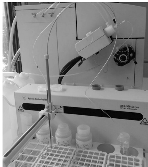
Figure 1. ICP-MS device

The analysis of Pb, Cd, Hg, and As in the seafood samples was performed by using ICP- MS Agilent 7700X (Agilent, Turkey) according to the Guidelines of NMKL 186 (2007) instructions. Before starting the analysis, calibration blank solution, calibration standards, sample blank, control standards, and control samples were all prepared accordingly. Then, a 10 ml of the solution in the 25 ml flask was put into a 10 ml propylen tube. All the solutions were placed in to the ICP-MS device. The reading was started, completed, and the results were automatically processed by the software.