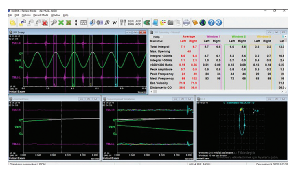
Figure 1: Joint vibration analysis record.

The average treatment duration for the 43 individuals in the treatment group was 6.1 \pm 0.50 months, and the mean age was 16.22 \pm 3.45 years [Table 1]. As shown in [Table 2], there was a statistically significant increase in the number of occlusal contact points at maximum intercuspation in the treatment group between T0 and T1 in the posterior regions (P < 0.05), anterior regions (P < 0.001), and in total (P < 0.001). No significant difference was observed between the treatment group at T0 and T1 and the control group in the number of anterior, posterior, and total occlusal contact