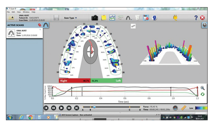
Figure 2: Screen shot of force/timeline, two-dimensional and threedimensional graph of maximum occlusal force recording taken.