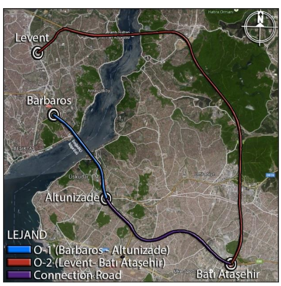
Figure 2. Research area