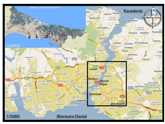
Figure 1. Location of the research area

O-2 (Highway 2, Istanbul's 2nd beltway); It is the second highway surrounding Istanbul. It has a larger arc than the first beltwaynamed O-1. It is two-sided and has eight lanes. It passes over the Bosphorus like O-1. It uses the Fatih Sultan Mehmet Bridge when passing the Bosphorus. O-2 has direct access to O-1, O-3 and O-4.