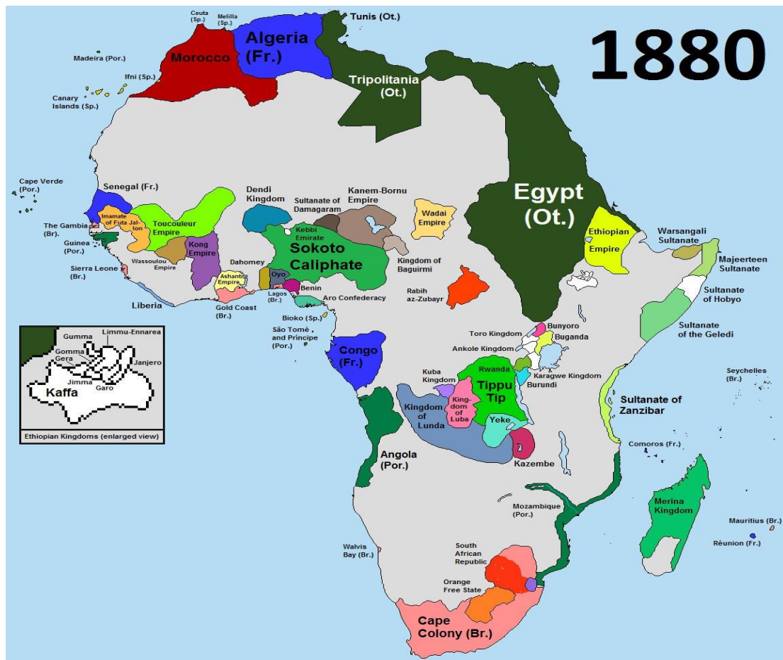
Figure 1 Henry Miller, (November 25, 2017). “Mapped Africa Before and After Colonialism, https://matadornetwork.com/read/mapped-africa-scramble-africa/

As previously noted, since violence had been a significant part of the lives of the majority who inhabited those areas, colonialism was another major factor in igniting conflict in those locations. East Africa as a whole and especially Somalia, have been identified as being among the world's most volatile and dangerous places. The Map 1 depicts Africa in general before colonialism. However, rather than boundaries, the territories were separated into kingdoms. Unlike now, tiny kingdoms and sultanates ruled over parts of east Africa for centuries.