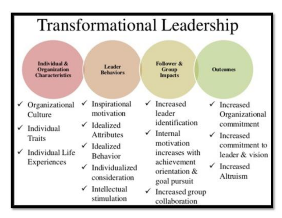
Figure 3 Transformational Leadership Effect

The results of (Jorge & Esteban, 2019: 68) study showed that there is a strong positive relationship between transformational leadership and the ability to improve the general atmosphere at work, as it creates an atmosphere of trust and satisfaction among employees, and the desire to move between different jobs decreases.