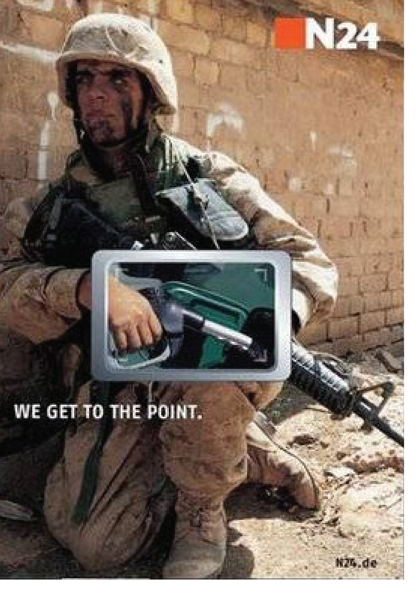
Figure 6. Poster with social context (http://www.outofbox.in/33-best-print-ads/)