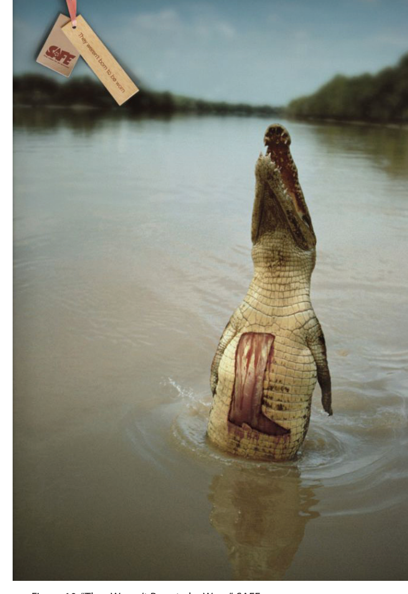
Figure 10. "They Weren't Born to be Worn", SAFE (http://creativeadvertisingworld.com/wwf-and-safe/)

Designer may plan to awake some associations on the consumer's mind that are over the visual. Photograph has a special importance in social contented posters. The usage of