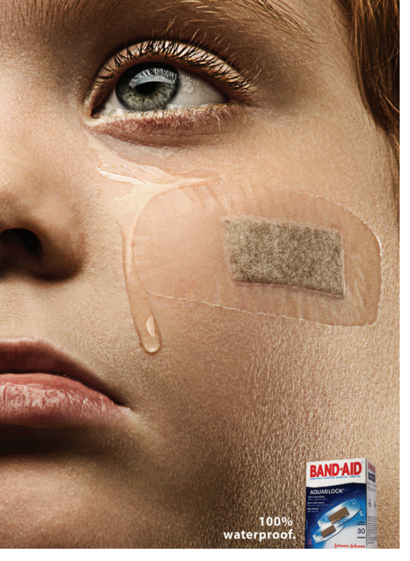
Figure 11. Advertising poster

We have a very competitive advertisement media so to affect the consumers advertisers search extraordinary compositions. And this makes the creativity very important at advertisement photography.