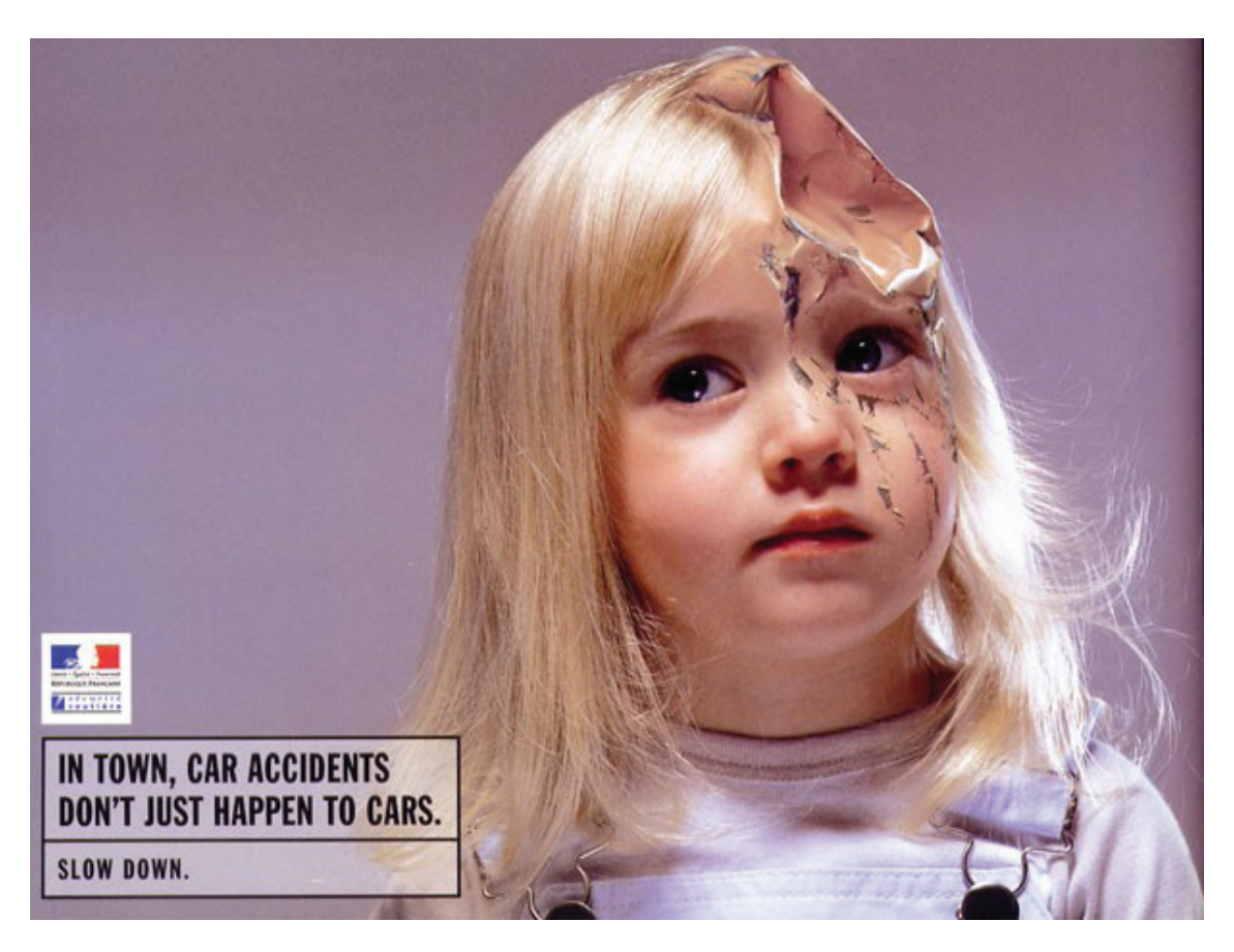
Figure 1. Poster with social context (http://desigg.com/daily-design-inspiration-4-120-creative-advertisements)

There is 940 years between the first paper and invention of typewriter. Printing traveled from China to Europe in 231 years and 174 years more was needed for the first printer to take place. But when we look at the last century, there is only 19 years between the first print press magazine and the communication arts magazine. Very next year after the first apple computer, which works on byte maps, front-page software came to stage and tabletop publishing term is defined. After only four years Photoshop is released. When we reach 20th century, graphic design changes at a dizzying pace in parallel with technological developments.