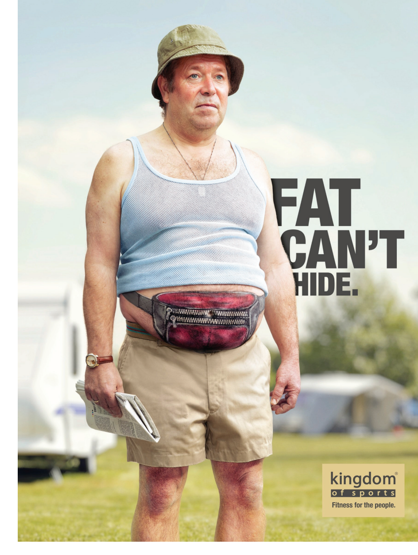
Figure 2. Advertising poster (http://www.creativeadawards.com/fat-cant-hide-2/)

For example, posters with social content are designed to inform the community about topics like environment, health, education, family planning, avoiding traffic accidents, cigarettes and alcohol and Aids etc. Posters brochures and open-air advertisements can attain all classes of