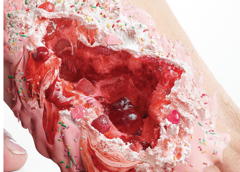
Figure 3. Poster with social context (http://sala7design.com.br/2016/02/sweet-kills-pecas-que-apresentam-riscos-da-diabetes.html)

43444649175589/594595287393856/?typ e=3&theater). At this point, the prospect of photographic art is increasing day by day with the possibilities of developing computers and computer programs. Parallel to these, in our days as visually gained so much importance; photography in poster design is a simple, effective and powerful way of conveying clear and direct message to the recipient.