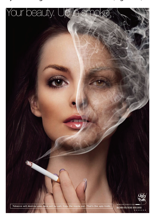
Figure 4. Poster with social context (http://www.luerzersarchive.com/en/magazine/print-detail/mccann-healthcare-worldwide-japan-inc-46499. html)

Photography is used instead of writing in an advertisement to make the impact, which is aimed by the designer on viewer-receiver (Figure 4.).