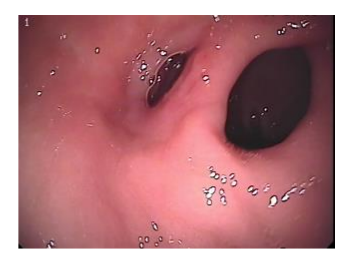
Figure 2. The control gastroscopy image of the patient.

As a result of biopsy taken from the periphery of the ulcer, chronic active gastritis and HP positivity were detected. Oral HP eradication treatment (Amoxicilin 2000 mg/day and Klaritromycin 1000 mg/day, 2 weeks) and pantoprazole treatment (40 mg/day, 2 months) were applied to the patient. In the control gastroscopy performed after two months of medical treatment, it was observed that the ulcer in the antrum healed, but a second lumen opened from the ulcer area to the bulb. The control gastroscopy image of the patient is shown in Figure 2.