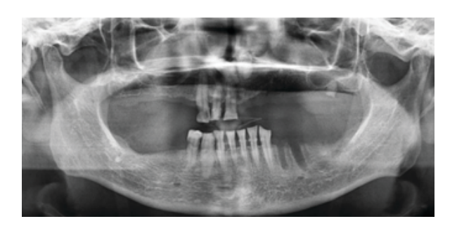
Figure 1. Orthopantomography of the patient showing radiopaque formations in the maxillary midline

61 year-old female patient was referred to our faculty because of unidentified radiopaque areas located in the maxillary midline region detected on the radiographic examination (Fig.1).