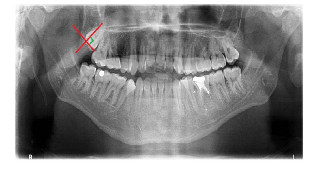
Figure 1. Class III and class C groups according to Archer (1975) classification. In panoramic images, it is seen that two lines intersect at 90 degrees, parallel to the long axis and occlusal plane of the third molar tooth impacted in the maxillary.

under 18 years of age who had suffered a trauma or accident in the head and neck region, undergone previous surgery on the sinus or skull base, and suffer from any syndromes or congenital anomalies (craniocytosis, hemi-facial microstomy) were excluded from the study (Fig. 1). A clear visualisation of the PTM was ensured in lateral cephalometric images. All radiographs were taken using the same cephalometry device (Morita Veraviewpocs Dental X-ray 2D [Type: J. Morita, Kyoto, Japan]) with the Frankfort plane parallel to the ground, teeth in centric occlusion, and lips in resting position. Cephalometric radiographs were evaluated by the same researcher using the NemoCeph NX 9.0 software program (Nemotech, Imaging and Management Solutions, Chatsworth, Madrid, Spain) (Fig. 2). To evaluate the method error, 50 films were redrawn and measured again by the same researcher 2 weeks later. Paired t test was applied between the first and second measurements and no statistically significant difference was found between the two measurements. These results show that our drawings and measurements are repeatable.