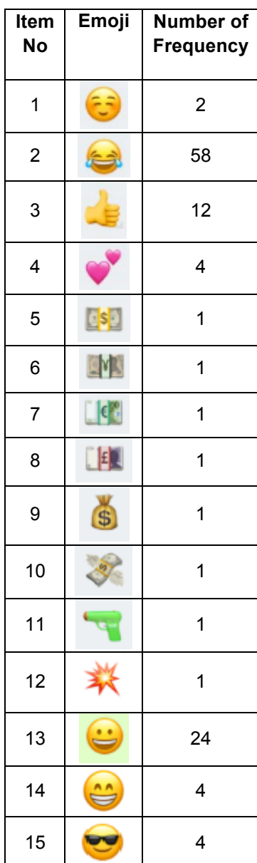
Table 3: Examining the emojis used in the messaging group

In the following table which emojis are used and how often they are used is going to be searched out and then it will be seen which emoji is mostly preferred by the members of messaging group. In the table the emojis are going to be sequenced starting with the first emoji used in the communication process and followed by the others and then their frequency is going to be determined.