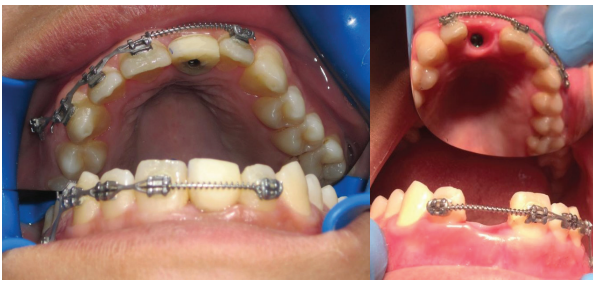
Figure 2: Final temporary restoration adjustment and soft tissue emergence