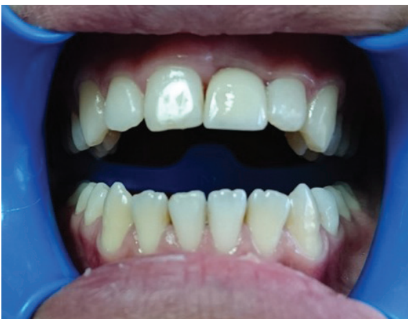
Figure 3: Final prosthetic delivery