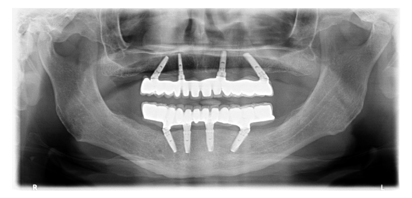
Figure 4. OPG after 1-year.