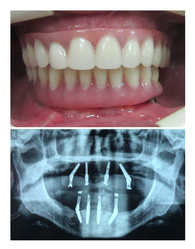
Figure 2. Immediate screw-retained acrylic prostheses after 1 month. Acrylic fracture at the left molar region of lower denture is seen.

Three months after the surgery, open tray impressions were made for the definitive restorations after the removal of the interim denture. Co-Cr metal frameworks were casted in laboratory. The frameworks were checked for passive fit then screwed on the abutments and maxillomandibular relation was recorded. Following porcelain veneering, occlusion, centric relation, aesthetics and phonetics were evaluated and necessary modifications were made at the try-in session. Completed restorations were inserted and screwed in place with a torque of 35Ncm (Fig. 3). The screw holes were filled with composite resin material that matches the porcelain shade (Filtek Z 250 Universal Restorative, 3M ESPE, St Paul, Minneapolis, United States).