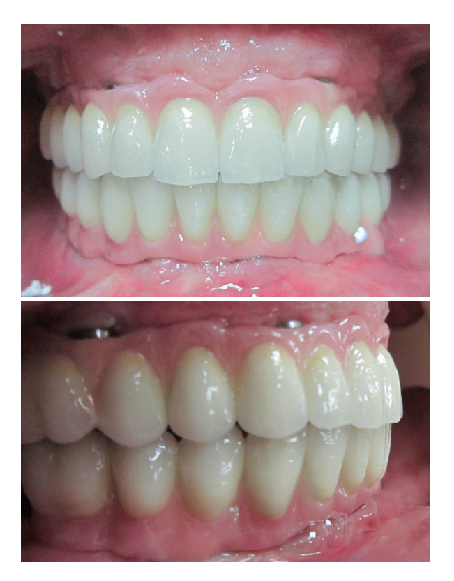
Figure 3. Definitive prostheses.

Three months after the surgery, open tray impressions were made for the definitive restorations after the removal of the interim denture. Co-Cr metal frameworks were casted in laboratory. The frameworks were checked for passive fit then screwed on the abutments and maxillomandibular relation was recorded. Following porcelain veneering, occlusion, centric relation, aesthetics and phonetics were evaluated and necessary modifications were made at the try-in session. Completed restorations were inserted and screwed in place with a torque of 35Ncm (Fig. 3). The screw holes were filled with composite resin material that matches the porcelain shade (Filtek Z 250 Universal Restorative, 3M ESPE, St Paul, Minneapolis, United States).