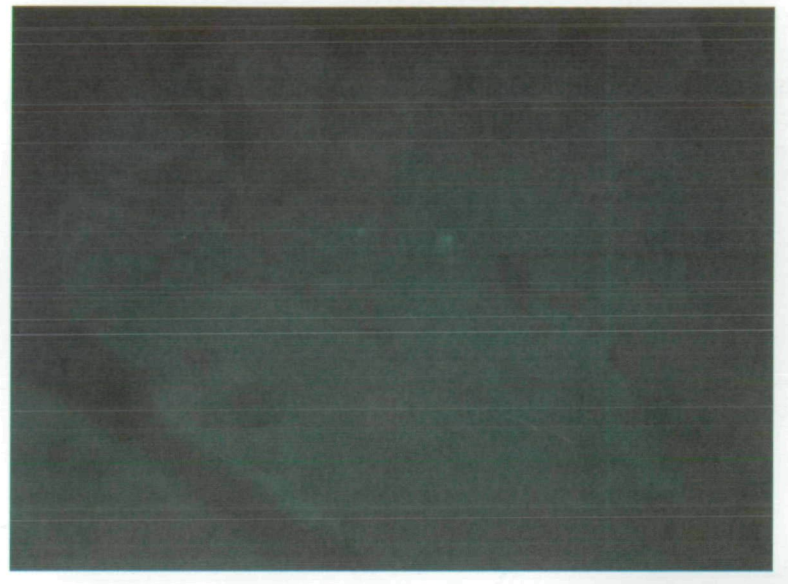
Fig 2. Dextran in Lamina propria Şekil 2. Lamina propriada dekstran

the negative group was not transported into the lamina propria.