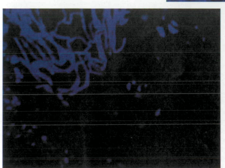
Fig 4. Albumin in lumen Şekil 4. Lumende albumin