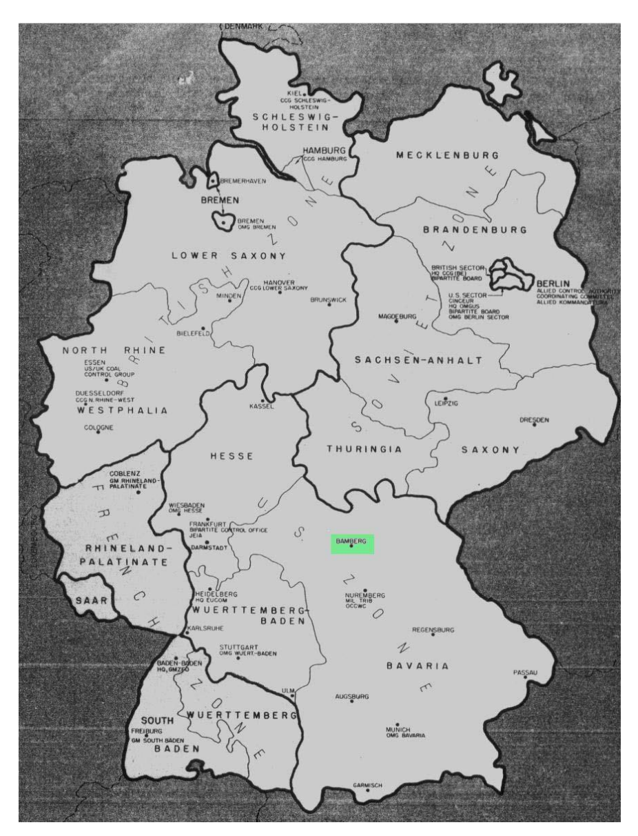
Figure 4: Map of the zones occupied by the allied forces

Meaning that they choose to maintain their position concerning women all through their occupation period in Germany.