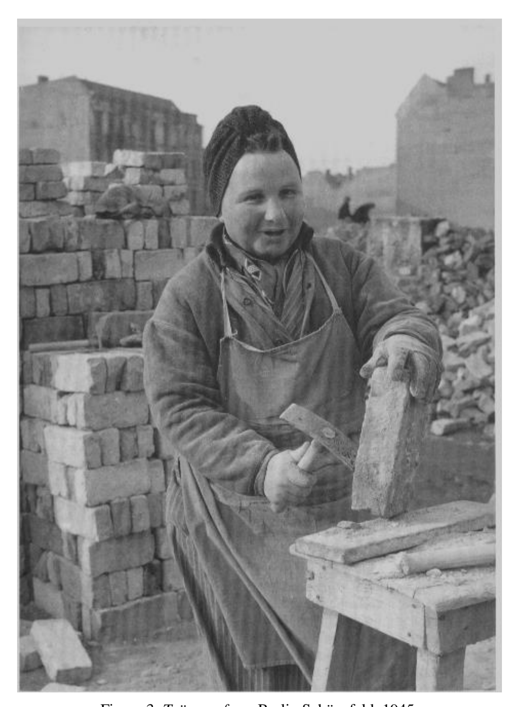
Figure 3: Trümmerfrau, Berlin Schönefeld, 1945.