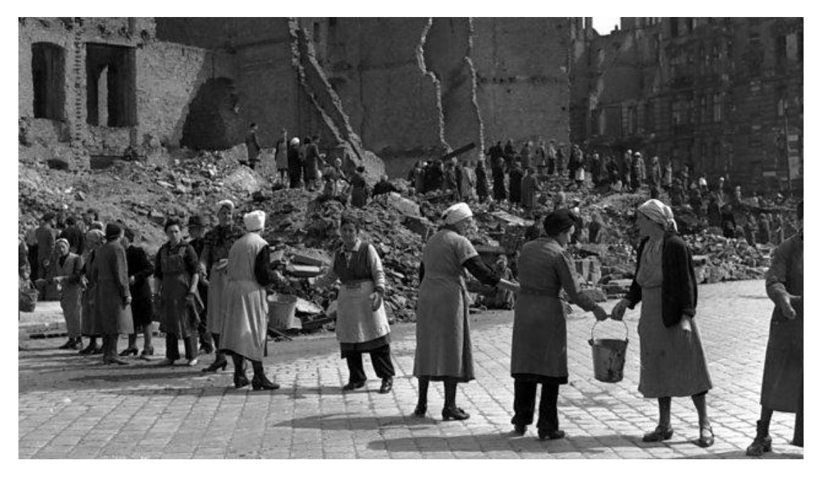
Figure 2. A chain of women with bucket removing piles of collapsed building in the country's reconstruction phase.

World War II was observed to have catastrophic impact on Germany with the destruction of properties and a high casualty of both civilian and soldiers with Starke (2018) noting that Germany suffered about 6.9 million casualties which 3.3 million are soldiers and 3.6 million Civilians due to the intensified allied bombing campaign and invasion of Germany territory which as a result, the losses in both material infrastructure and capital were huge. However, there had been nagging question of women not getting the recognition they deserve for their role in the economic and peaceful society that Germany currently enjoy despite a popular image of the aftermath of the war showing a chain of women with bucket removing piles of collapsed building in the country's reconstruction phase (Figure 2).